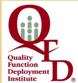
QFD Institute, USA