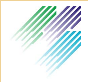
Business Excellence Solutions Ltd., Finland